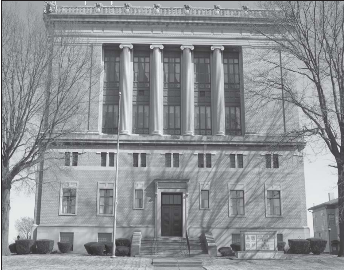
Masonic Temple, Canton, Ohio